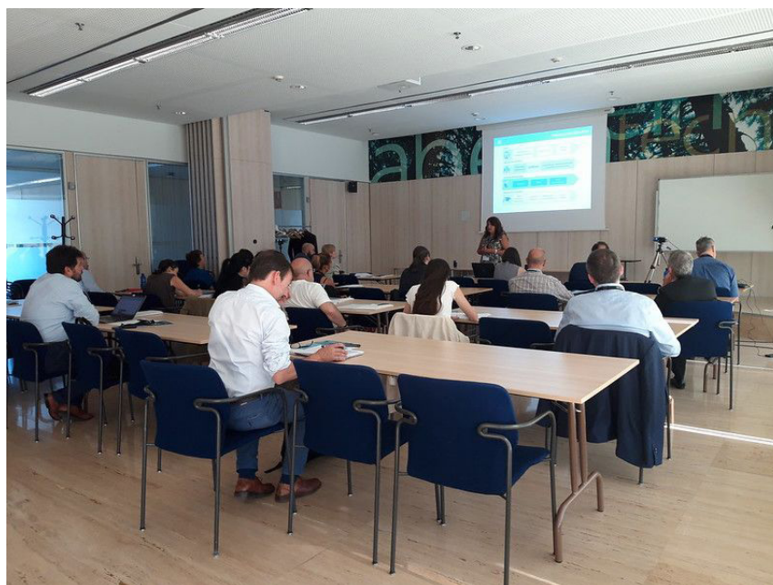
The DIH-HERO Infoday at Tecnalia

Furthermore every hub organized regional Info-days where SMEs got invited to be informed about the cascade funding and application opportunities.